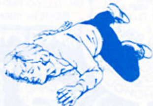
THE RECOVERY POSITION

If you notice any of these signs TAKE A BREAK: chill out immediately. Have a long cool drink (not alcohol as it will dehydrate you even more). If someone complains of these symptoms or collapses, then their temperature must be reduced very quickly.